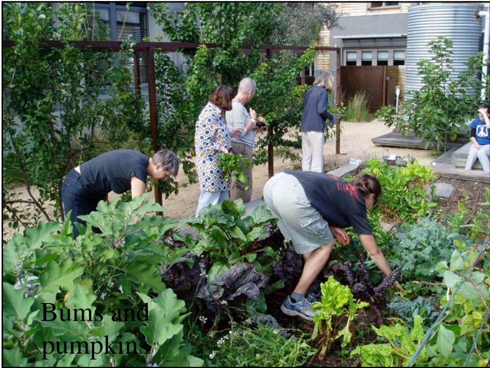
Bums and pumpkins