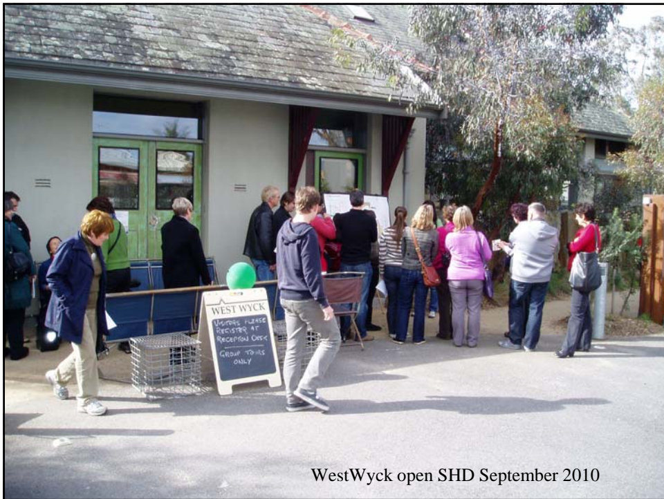
WestWyck open SHD September 2010