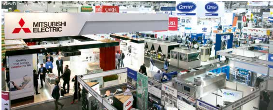
ARBS exhibitors took things to another level in 2016.