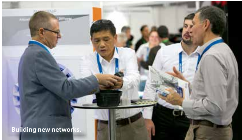
Building new networks.