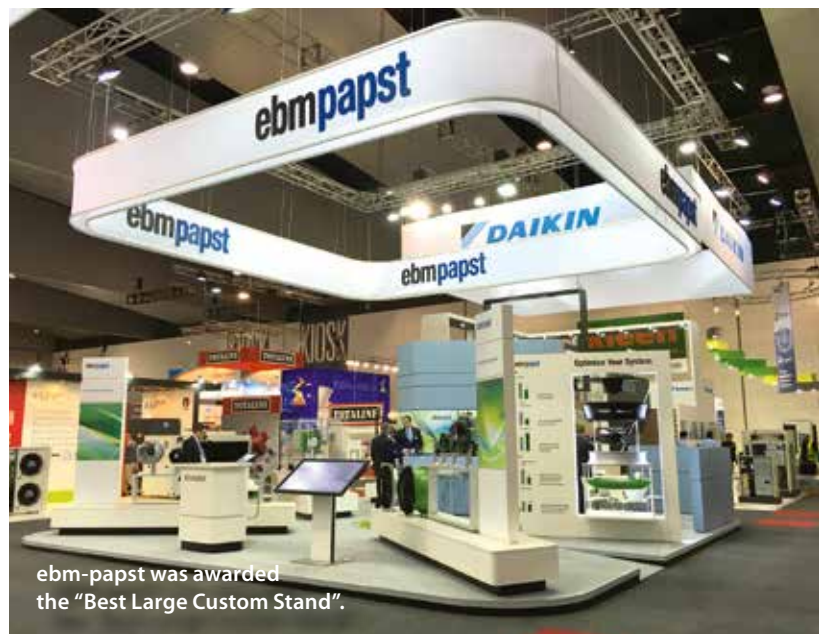
ebm-papst was awarded the "Best Large Custom Stand".