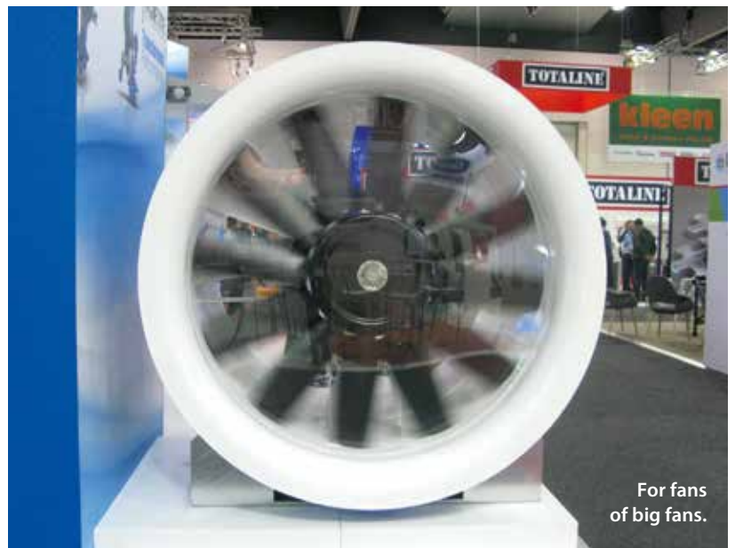
For fans of big fans.