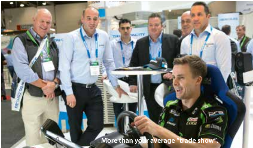
More than your average "trade show".