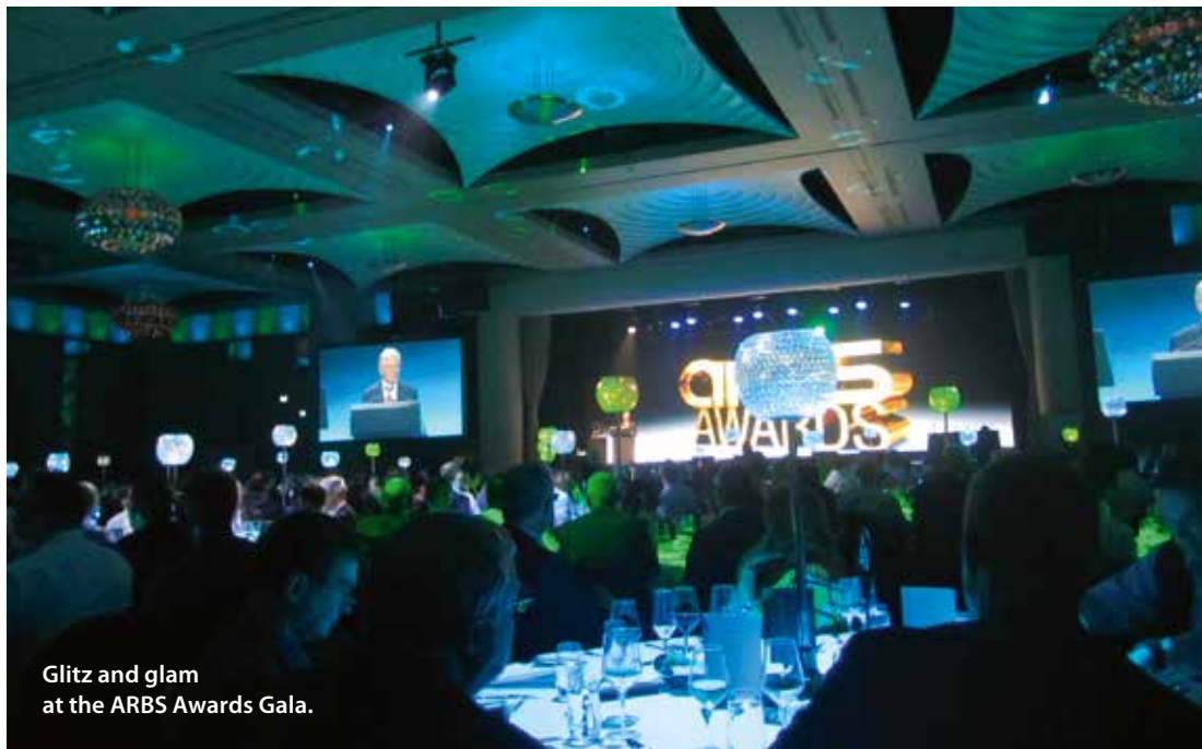
Glitz and glam at the ARBS Awards Gala.