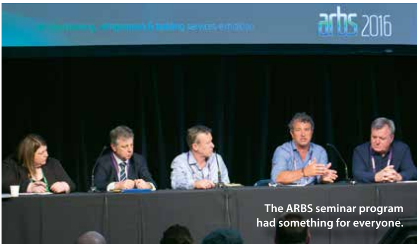
The ARBS seminar program had something for everyone.