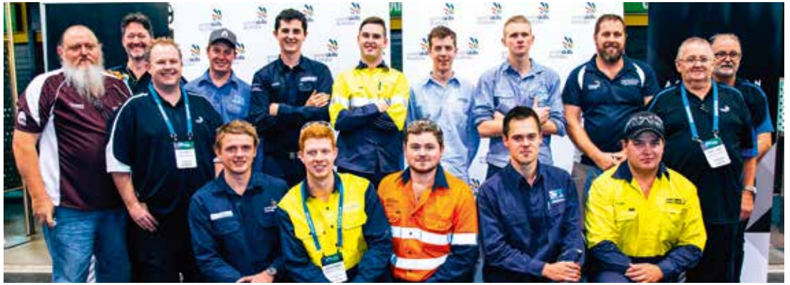
WorldSkills warriors. Australia's best refrigeration apprentices battled it out across three days.

Westpac St. George HQ Refurbishment – Norman Disney & Young and Westpac Corporation