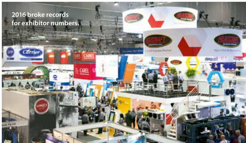
2016 broke records for exhibitor numbers.