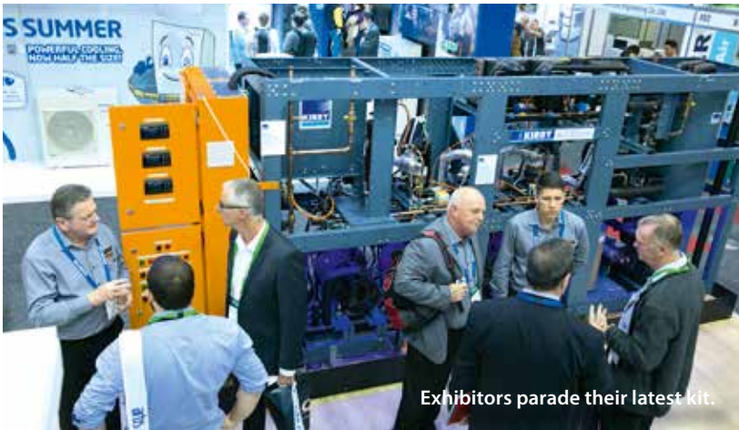
Exhibitors parade their latest kit.